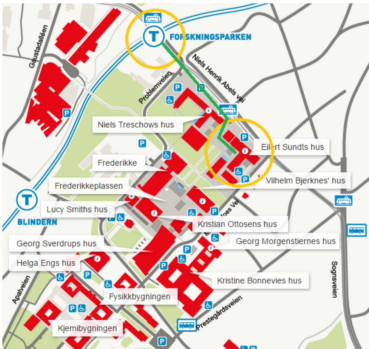
Directions from the subway station to Eilert Sundts Hus